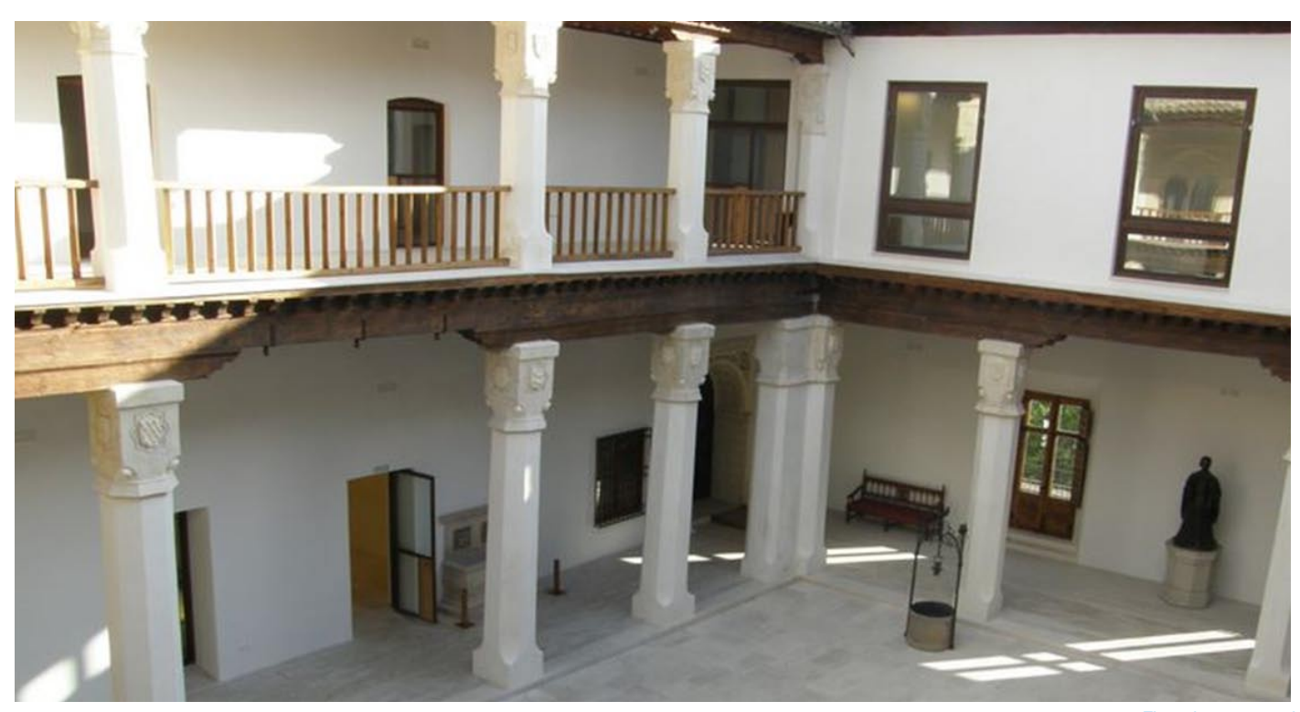
The palace courtyard

The Palacio de Fuensalida, built in the 15th century and commissioned by Pedro López de Ayala, is the finest example of a palace built in the Toledo Mudéjar style. Toledo Mudéjar is a blend of three art forms, Gothic, Plateresque and Mudéjar, into a type of architecture of which very few specimens remain in the Spanish historical heritage.