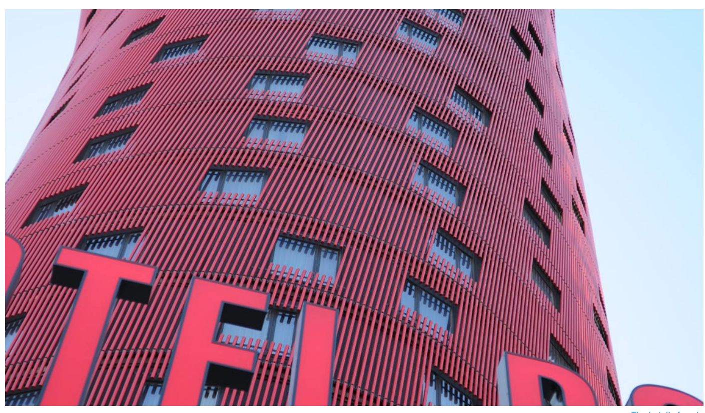
The hotel's façade

The total investment has been in excess of 90 million euro