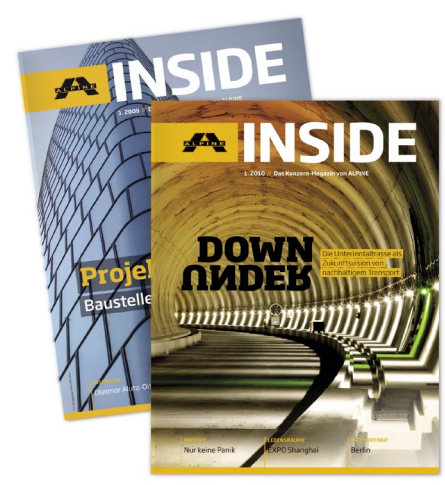
Covers of Inside

All issues are published in house by ALPINE. In addition to the printed version, readers can get an on-line version at: http://inside.alpine.at.