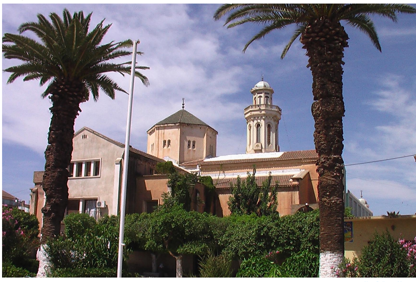
New Relizane Mosque

The new line between Relizane and Tissemsilt is 185 kilometres long and is scheduled to be completed within 54 months